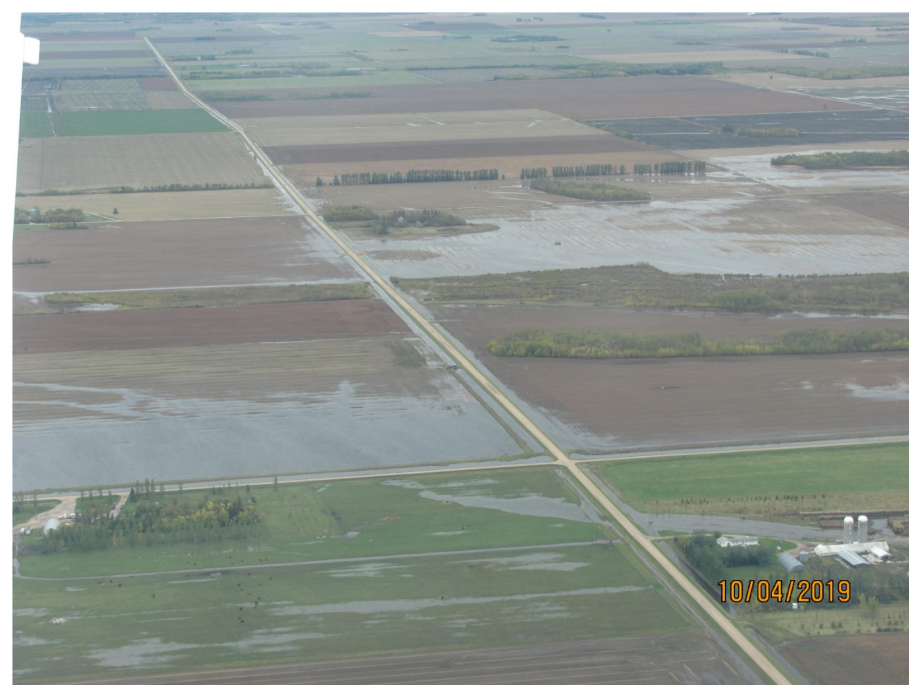
Looking south at Roseau Co Rd 103. Section 4 Barto Twp on left; Section 5 Barto Twp on right